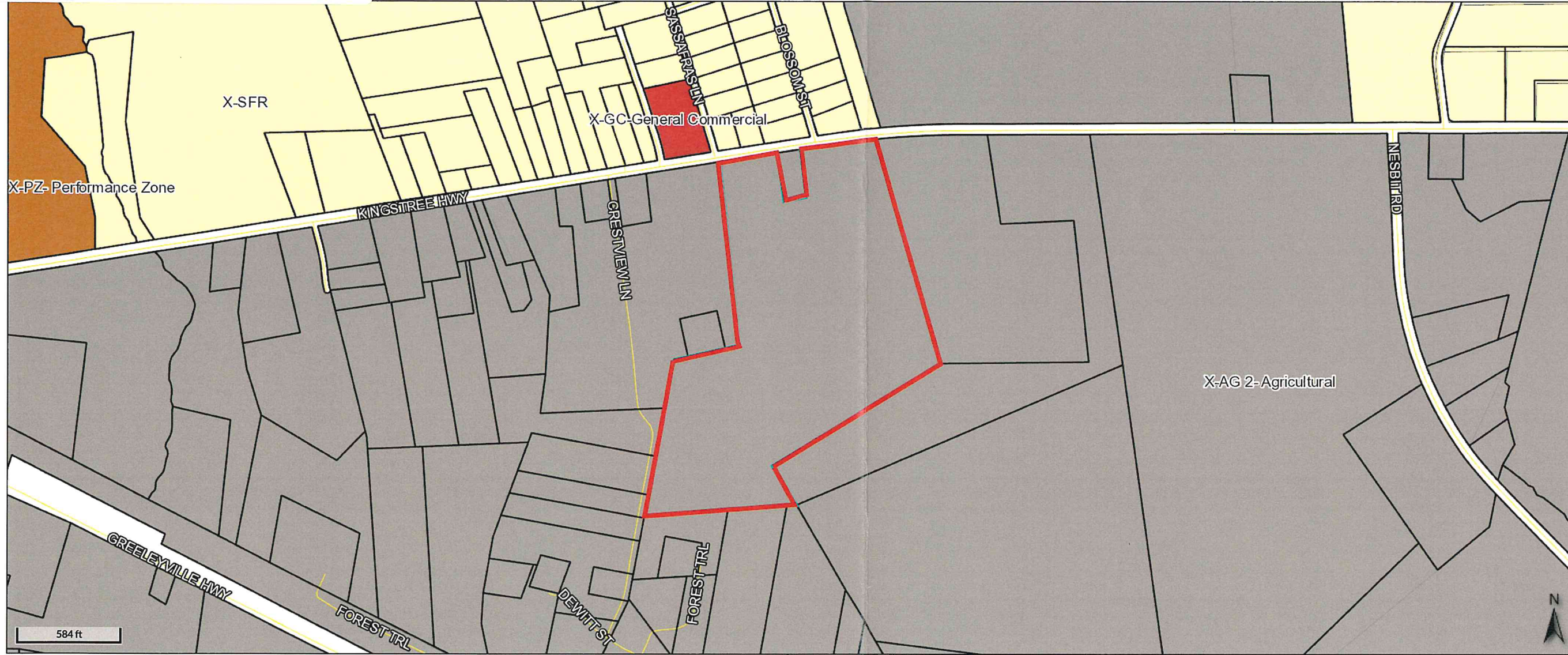
EXHIBIT A ORDINANCE 2021-05 Z-21-01